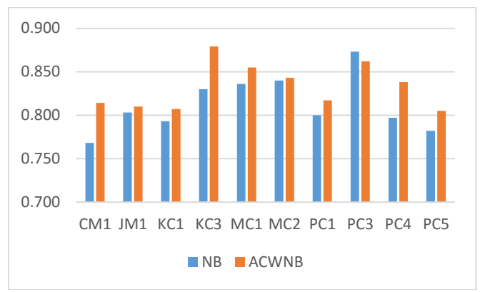
Figure 2 Performance (AUC) of the Models

The results of the comparison of the AUC can be described in Figure 2. The AUC values of AC-WNB higher than NB. It can be concluded that Absolute Correlation based Weighted Attribute-class Naïve Bayes is much better than others method. However, this increase should be examined more deeply with significance test.